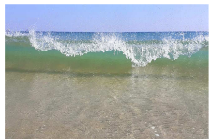
Aile & Ile Associés « Carte Blanche »